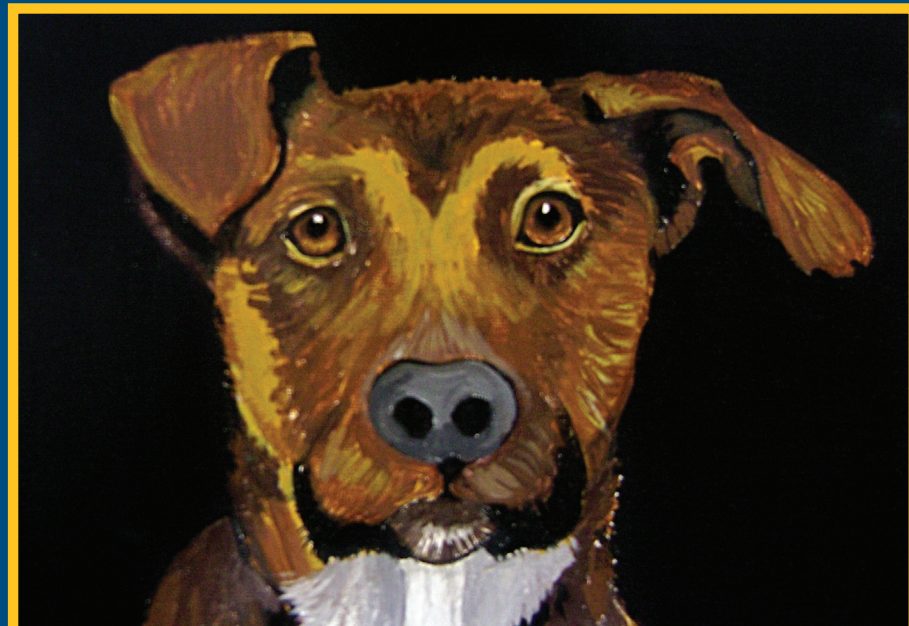
Artwork by Kairos clients | Design by Michaels & Michaels Creative, LLC